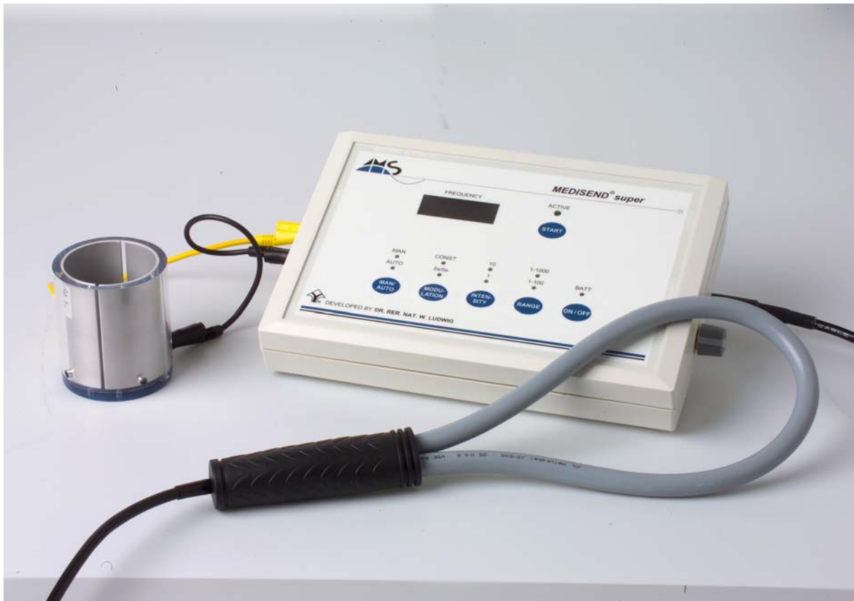
Fig.: MEDISEND®super with magneto-loop and MEDICUP – magnetotherapy and bioresonance therapy in one system

Then laser acupuncture was performed with the CEPES-Laser® and an ampoule of Allergie-Injektapas in the plug-in attachment. The ear points 55, 78, Thymus Interferon, eye, sensitive line and Gb 20 bds., Bl 1 + 2, Di 20, Pam 3 and Di 4 were treated.