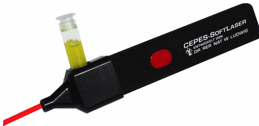
Figure: CEPES-Laser® - a red-light soft magnetic field laser with plug-in attachment for an ampoule to transmit substrates

The CEPES-Laser® is a red-light soft laser (mean value 650 nm), which also has a pulsating magnetic field (9 Hz). It therefore has a very high penetration depth into the organism; the pulsating magnetic field permanently supports the laser effect!