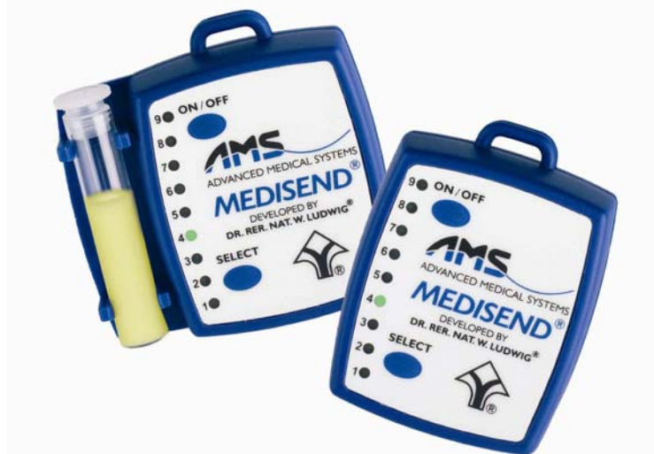
Fig.: MEDISEND® with and without ampoule holder

Reporter: Do you use one of your small devices - the MEDISEND® for instance – on yourself too?