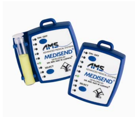
Fig.: MEDISEND® with and without ampoule holder