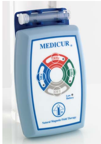
Fig.: MEDICUR ® with ampoule holder