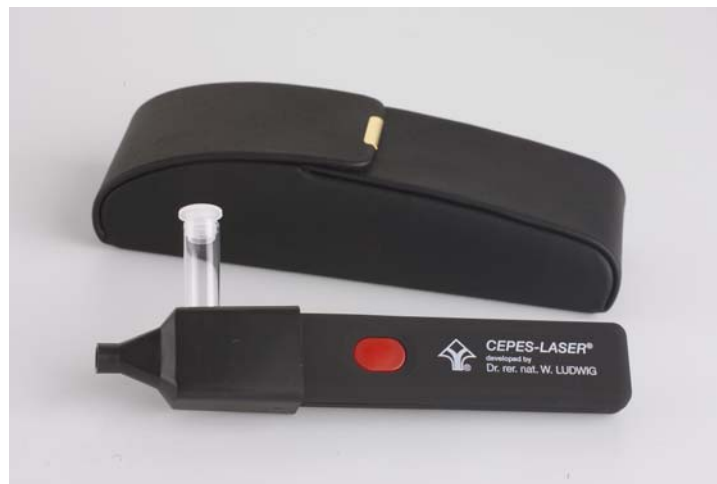
Figure: CEPES-Laser® - a red-light soft magnetic field laser with plug-in attachment for an ampoule to transmit substrates