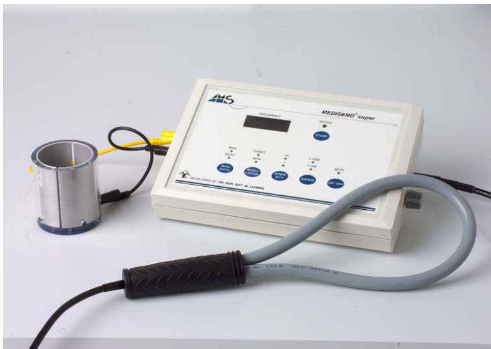
Fig.: MEDISEND®super with magneto-loop and MEDICUP – magnetotherapy and bioresonance therapy in one system.