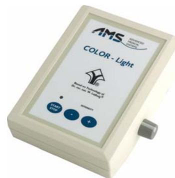
Fig.: Control box for adjusting the color and the intensity of the light

The COLOR-Light / AMS practice device combination guarantees synergistic effects through networking with other tried-and-tested natural healing procedures!