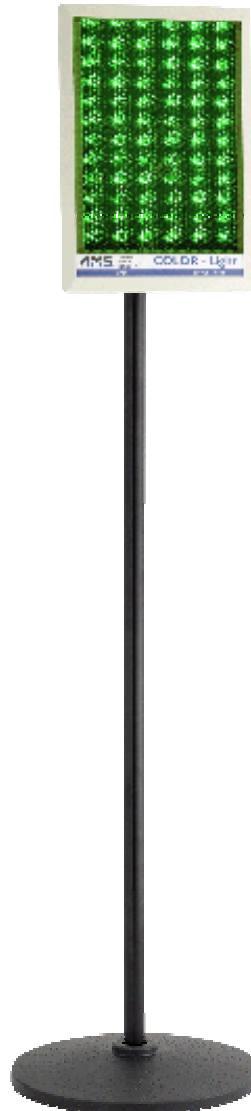
Fig.: COLOR-Light with stand

COLOR-Light – more than just a simple light shower!