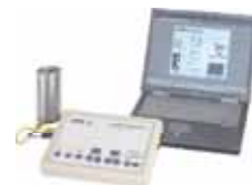
WAVE TRANSFER C

Buy once – All following systems/ devices head: