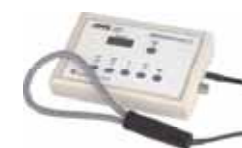
MEDISEND® super C