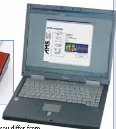
Laptop may differ from the illustration.